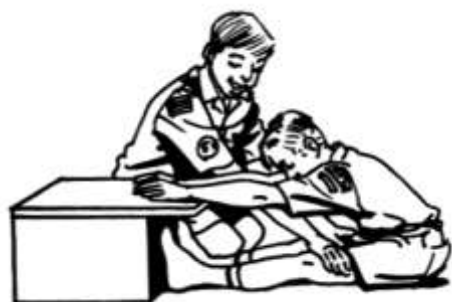
"Sit and reach" to measure lower-back flexibility.